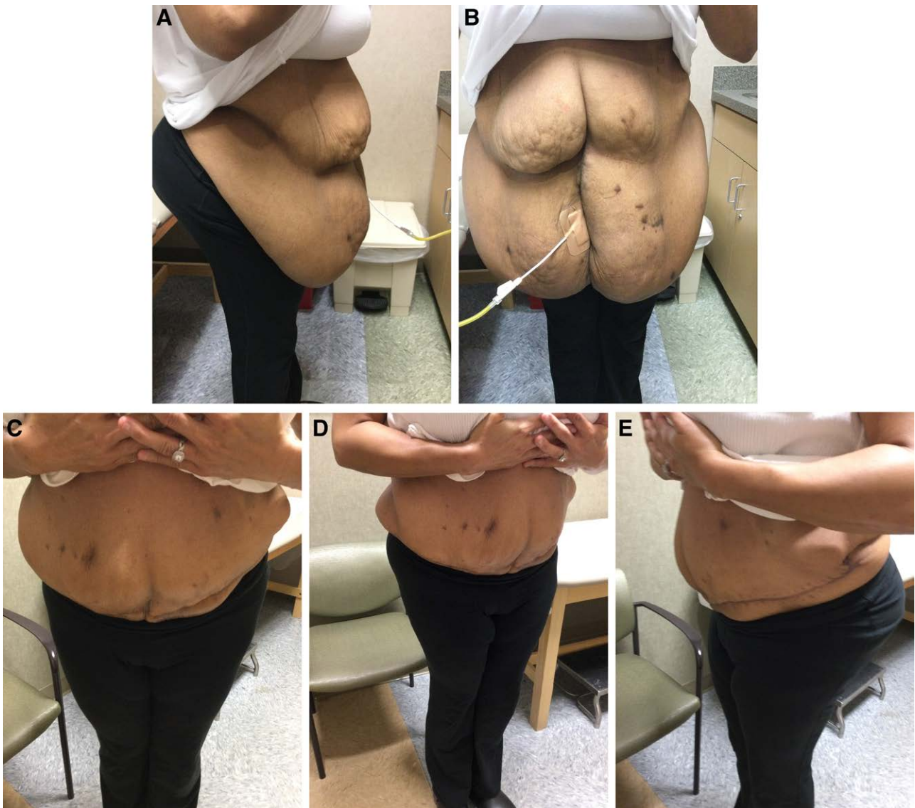
Fig. 2. Preoperative and postoperative images of a CP-AWR patient. A, Preoperative clinic photograph taken from the patient's side. B, Preoperative clinic photograph taken from the patient's front. C, Postoperative follow-up clinic photograph taken from the patient's front. D–E, Postoperative follow-up clinic photographs taken from the patient's sides.

abdominal wall reconstruction (AWR) but also those who underwent concomitant panniculectomy. Over the course of the study period, patients remained complex, as demonstrated by their obesity, large hernia defect size, high rate of prior failed hernia repairs, use of component separation, and necessary measures to combat infectious complications postoperatively. Yet, despite these risk factors, patients had low rates of wound morbidity and postoperative complications.